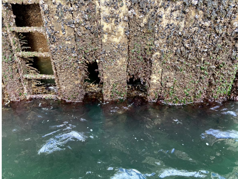
Distressed timber in the lower splash zone