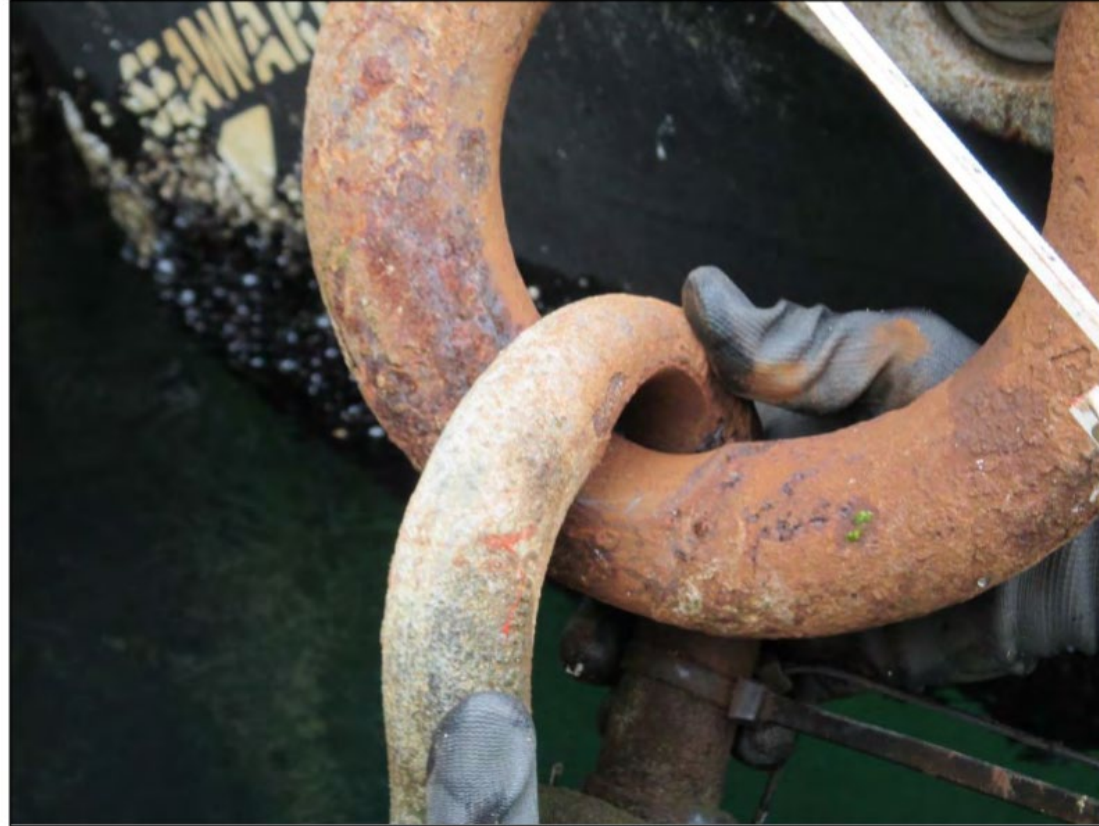
Wear on shackle