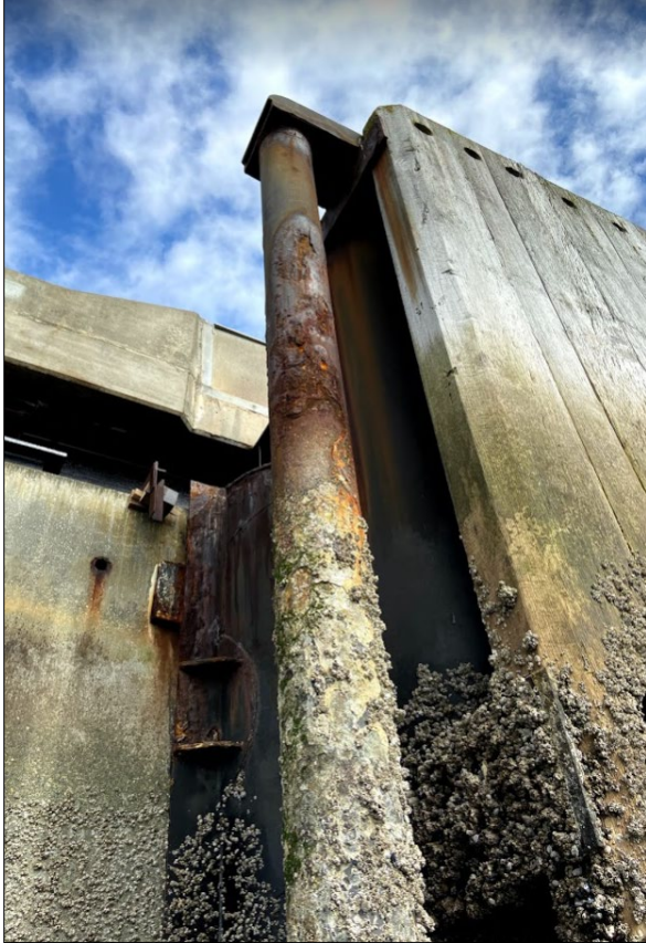
Oxidation of steel in the upper splash zone